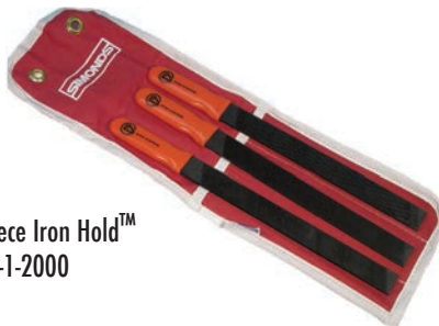
3-piece Iron Hold™ 999-1-2000