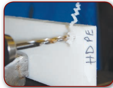
High density polyethylene is no match for the cutting ability of the Cryo Turbo-Tip!