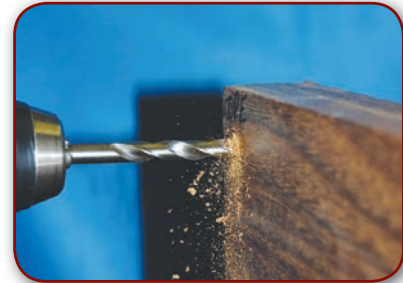
Cryo Turbo-Tip powers through hard woods - even Ipe!