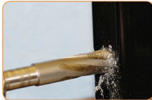
Cuts faster than drill bits!