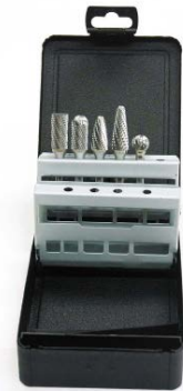
999-8-0003 5pc 1/2" diameter Sturdy Metal Index