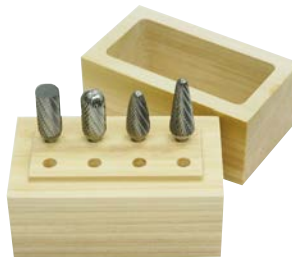
999-8-0002 4pc 1/2" diameter Custom Wooden Box