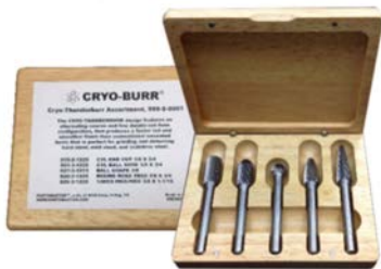
999-8-0001 5pc 3/8" diameter Magnetic Wooden Box