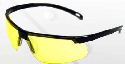
Amber lens safety glasses, Nemesis